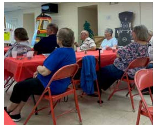
Adult Bible School participants