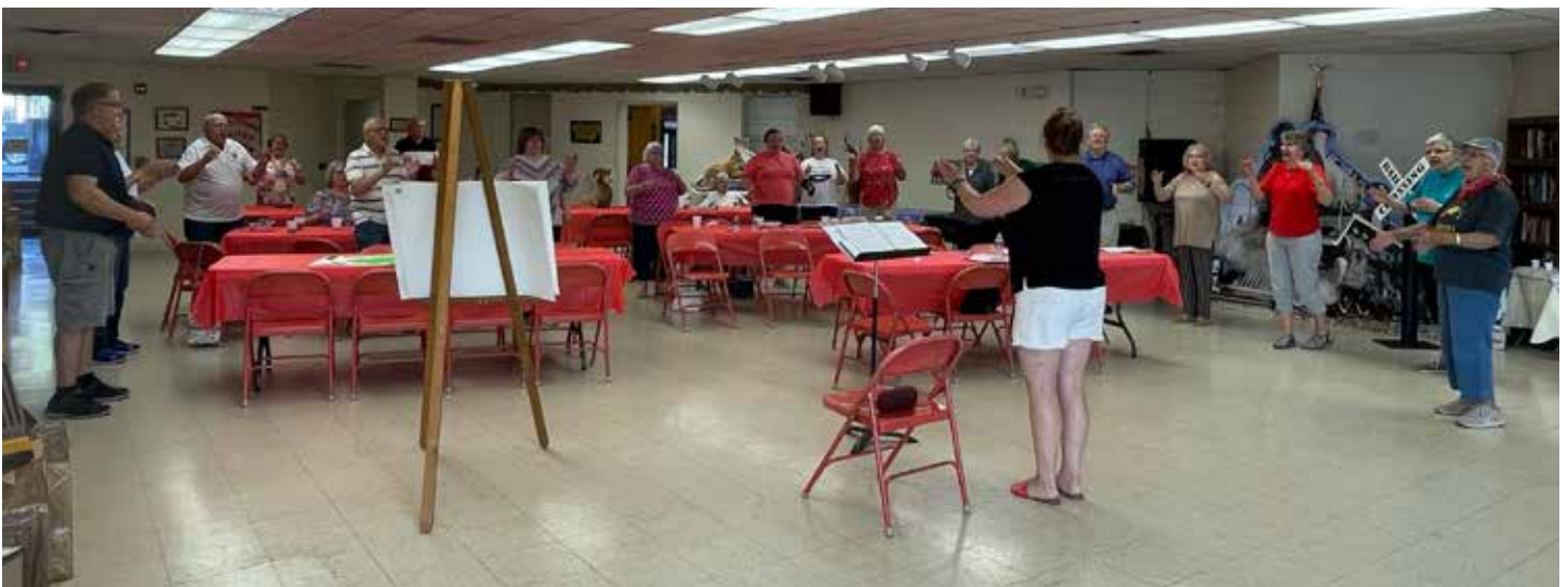
Adult Bible School Sing-A-Long