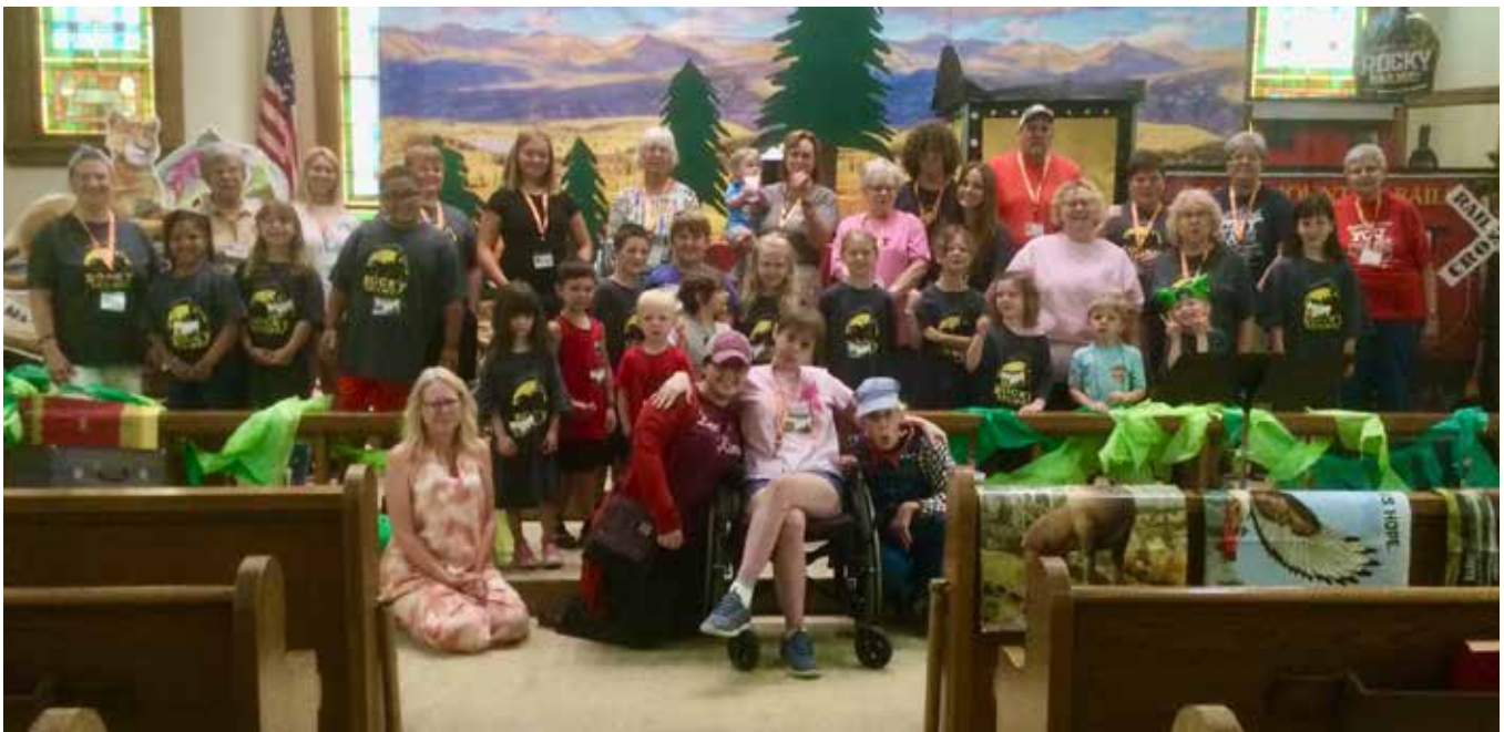
Bible School participants

The VBS Team wanted to do a VBS this year, so we asked for volunteers, and we were pleasantly surprised. God was good to us, and we want to thank all those that participated with their time and talents, and those that contributed with our snacks and drinks, and look forward to our next years VBS, SCUBA. So be prepared for another year of fun, and fellowship.