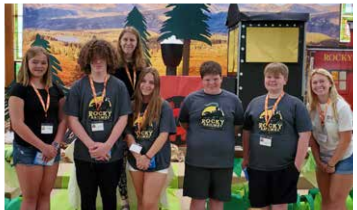
Bible School Teen Helpers