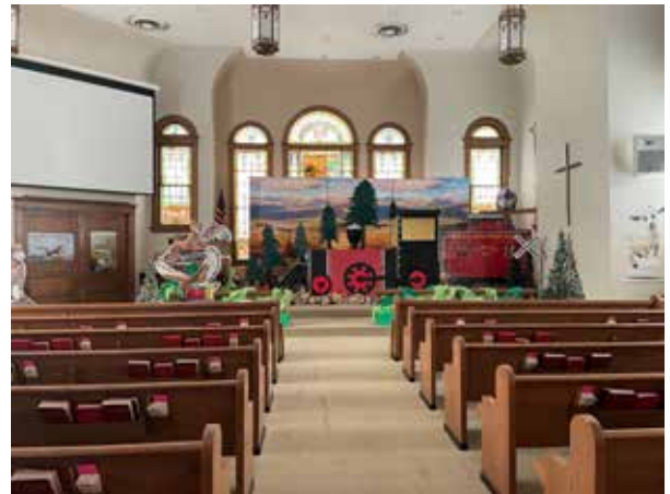
Sanctuary is ready for the week

Pine-Sol Cleaner: 4 Large bottles, 3 small bottles